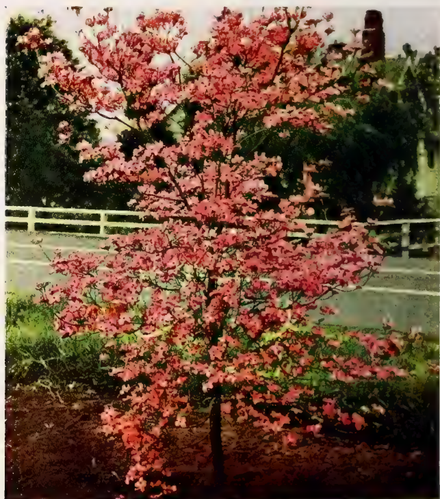
PINK FLOWERING DOGWOOD